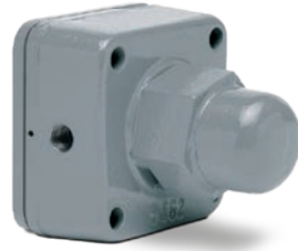
Optional air operated valve (AOV)

Available with a manually adjustable internal bypass valve (standard) or optional air operated valve (AOV) for high and low flow control.